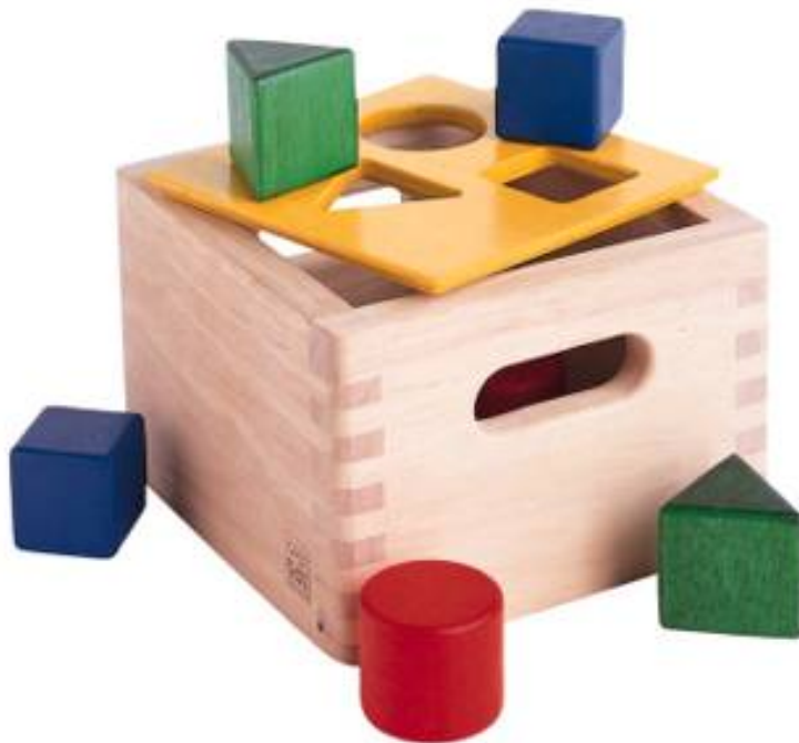
Figure 2.2: Box and blocks analogy from childhood memory: the holes on one end correspond to input templates, the holes on the other end correspond to output templates. Imagine blocks going in through one and out through the other. The blocks themselves correspond to input or output files with attached metadata . Profiles describe how one or more input blocks are transformed into output blocks, which may differ in type and number. Granted, I am stretching the analogy here; your childhood toy did not have this magic feature of course!

value, unassign a value, or copy a value from an input template or from a global parameter. Through these templates, the actual metadata can be constructed. Input templates and output templates always have a label describing their function. Upon input, this provides the means for the user to recognise and select the desired input template, and upon output, it allows the user to easily recognise the type of output file. How all this is specified exactly will be demonstrated in detail later.